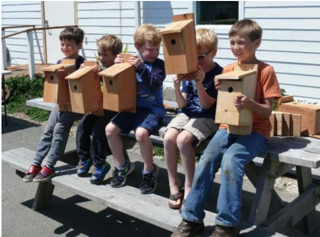
A den of Cub Scouts built birdhouses in 2019.

Father's Day, Sunday, June 19, will be "Build a birdhouse" day. Kids can bring dad, grandad, or any other responsible adult, tour the museum for free and build a birdhouse in the museum parking