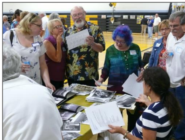
Alumni at the 2015 All School, All Class reunion.

An All-School, All-Class Reunion will be hosted by the museum Saturday, August 6, in the Bandon High gym from 1:00 to 4:00 pm. Admission is free. Anyone who has attended school in Bandon is welcome.