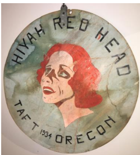
These three foot by three foot metal signs hung from telephone poles in Taft during the Redhead Round-up.