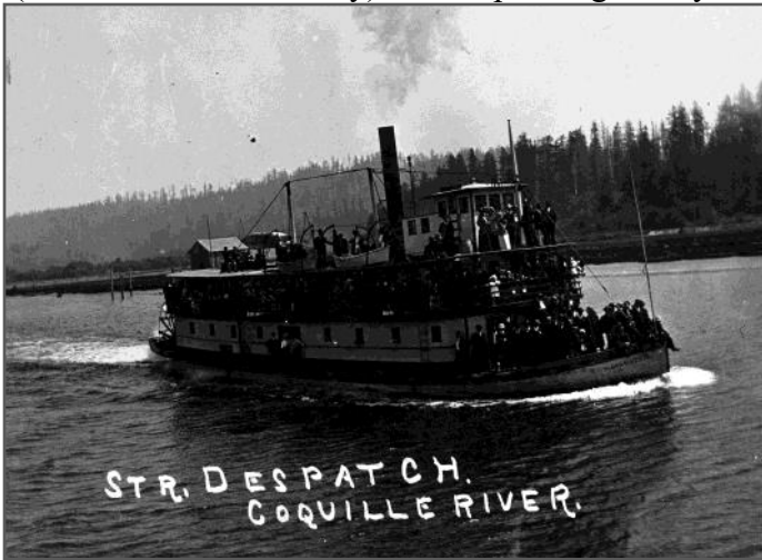
To get to the beach for some fun, convention goers took the train to Coquille, then boarded one of two steam paddle wheelers to get to Bandon. Someone misspelled the boat's name on this photo.

In August of 1909, the Oregon-Idaho Development Congress was holding meetings in Marshfield (later renamed Coos Bay). After spending Friday