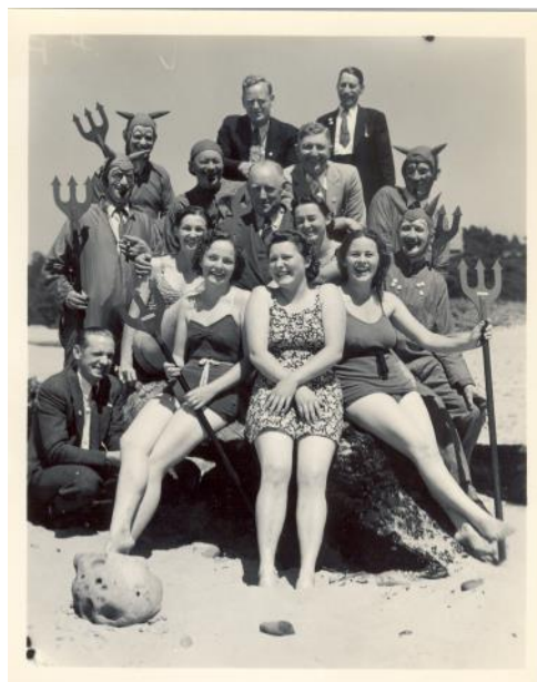
The Redhead Round-up brought thousands to the Oregon Coast in the 1930s.

"It was estimated that there were approximately two thousand cars in and around Taft bringing upwards of six thousand spectators to enjoy the varied programs," according to the Beach Resort News .