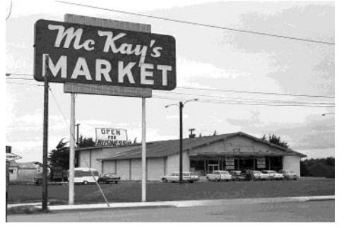
McKay's Market at its grand opening in 1960.

receipts, bring them to the museum and use them as an excuse to drop in and see us more often.