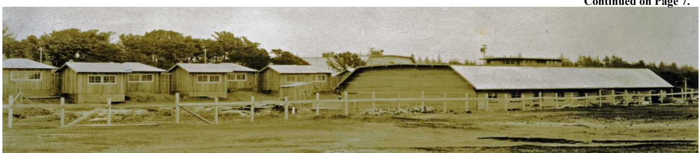
The Wecoma Cottages and Wecoma Baths, a salt water natatorium, were part of the tourist complex at the west end of Eleventh Street on Coquille Point. The peak of the Silver Spray is visible over the roof of the Wecoma Baths.