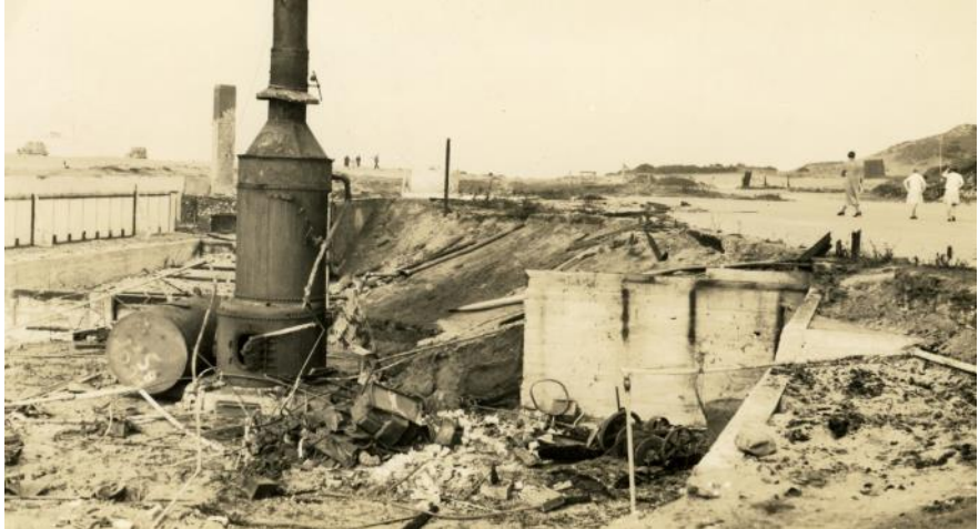
The furnace at the Wecoma Baths was the most visible reminder of the resort complex on Coquille Point to survive the 1936 fire.

Topping had his law office with its extensive