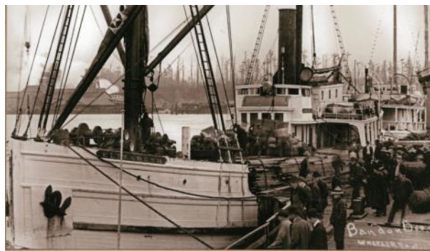
Steamship Elizabeth at the Bandon dock