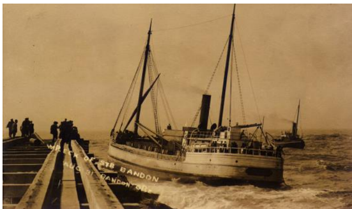
Schooner Bandon stuck on the South Jetty

Many ships served Bandon but the longest service for a wooden ship was undoubtedly the "Bandon". Built in 1907 on Coos Bay, she carried goods, passengers and lumber to and from Bandon until late in the 1940s. At 172 feet long, she was a large steam schooner, carrying nearly a million board feet of lumber when fully loaded including a large deck load. She was a lucky ship, hence her long life. In 1909 she was crossing the Bandon bar under tow of the tug Klihyam when strong current and wind pushed her onto the submerged part of the South Jetty.