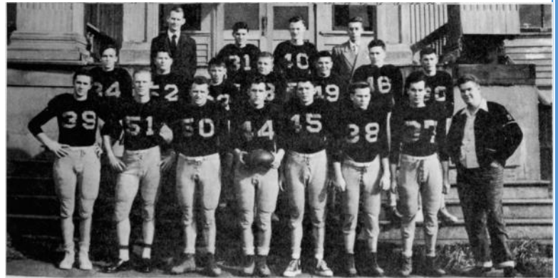
1950 Bandon High School Championship Football Team

The museum's artifact got a mention in the paper too: "At each banquet place was a clever souvenir program representing a gold football tied with black ribbon. Besides the program it contained names and data on the team, band, rally groups, words to the school song and a unique menu."