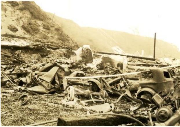
Remains of cars that were driven to the beach to escaped the fire.

15 or 20 minutes gathering up all we dared take out. In that time the fire had reached within 7 blocks of us. We then loaded the stuff into the car and trailer and just as we started out of the yard the roof of our neighbor's house across the street burst into flames; and everybody else was going through the same experience. In some instances the people loaded their cars and then the stuff got afire and they had to run for their lives. Some even got clear out of the burning area down on the Beach and the cars and stuff they