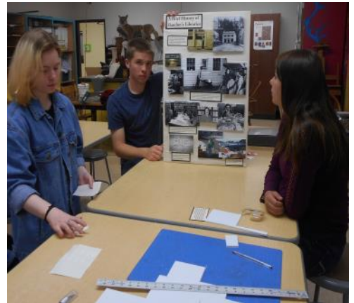
Bandon High Community Arts class students putting the display together

Students from Bandon High's Community Arts class, taught by Jen Ells , were at the Museum assembling the panel display for the Library's historical photos. Thank you for your help in putting the display together and to the Coos Cultural Coalition for a grant to help with materials!