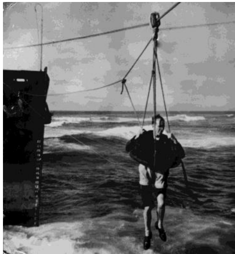
A breeches buoy in action.

have seen the boats in Venice in the canals and the man in the back of the boat, that's me. Eight guys rowing, and I gave them the stroke, and they would pull away together, weigh the oars. That was one of our drills. The reason for this drill is, in case of emergency and the boat does capsize, you will know what to do, get out from under it, pull yourself up with the boat. The ways you do it is: eight men and one at the back, you ship all the oars, secure them, everything that is loose is lashed down. The boats righting lines are coiled by each man, fourteen-fifteen ft. line with a float on it, coiled right beside him on the floor. On the side of the boat are the lifelines; they are the lines that are looped out there. When they come back to the boat, you must get ahold of them.