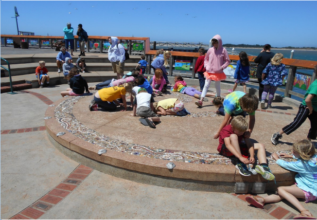
Summer Recreation History Detectives search the maze in the Port of Bandon's boardwalk.

More than 40 students in the Bandon Summer Recreation program became History Detectives for the day and went on a history hike that ended at the museum Thursday, June 22.