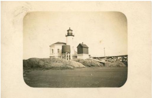
1909 Post Card to Lester Bundy