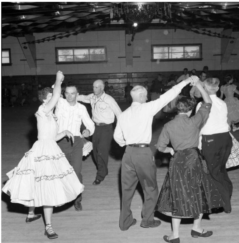
1957 Festival Square Dance at Tanglewood

the 2016 Cranberry parade and will be honored at the coronation. The museum helped prepare a photo tribute to the Goodbrods that will be on display at the ceremony.