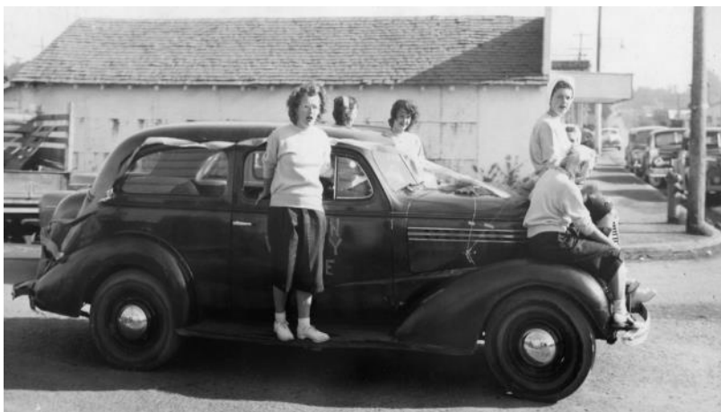
The Western World described the entry from the Bandon Variety Store as a girl-bedecked car.

Events have been added, the dates have changed, but the parade has been a part of the Bandon Cranberry Festival since 1948.