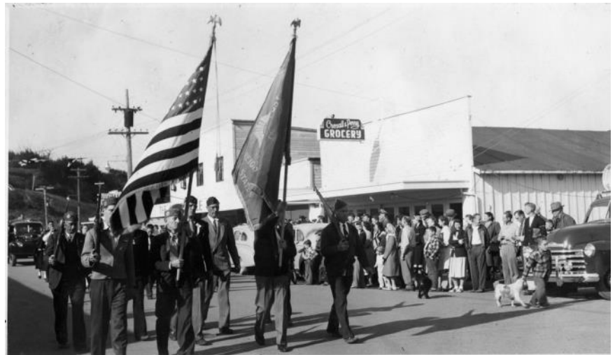
A VFW color guard led the way through downtown Bandon in the first Cranberry Festival parade in 1948.

A full page ad in the October 30 Western World advertised the “Big Three Events” to make up the first festival: the queen coronation and ball, the Cranberry Bowl football game and the Cranberry Festival dance to be held at “The Barn.”