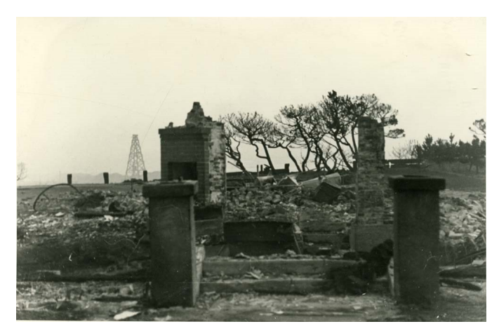
Residential Remains After The Fire

The current shape of the Bandon school system, the configuration of grades and buildings, was set 40 years ago in the aftermath of an arson fire that destroyed Bandon High School.