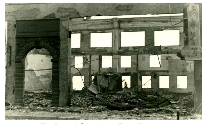
Fire Burned Out Almost Every Business

Bandon would remember the fire of 1914, a restaurant fire that spread and destroyed three city blocks, as "the big one" were it not for the 1936 fire, a forest fire that swept through the area destroying farms, neighborhoods and almost every business.