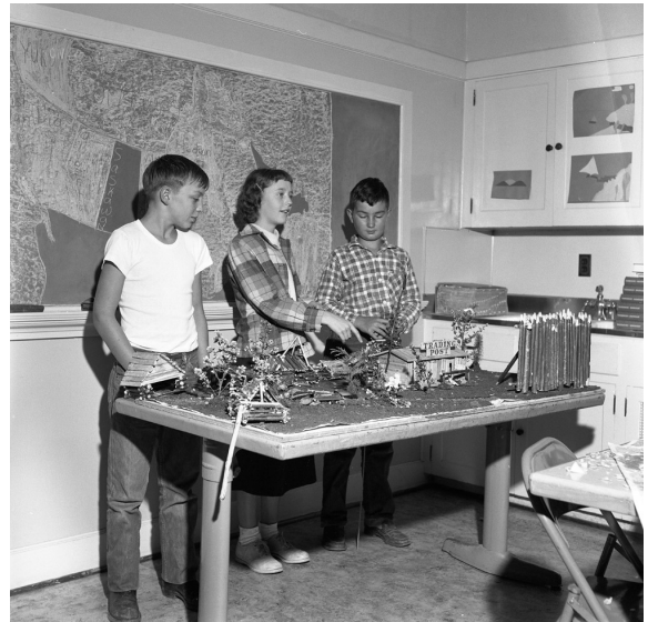
LANGLOIS SCHOOL DURING EDUCATION WEEK, NOV 1958