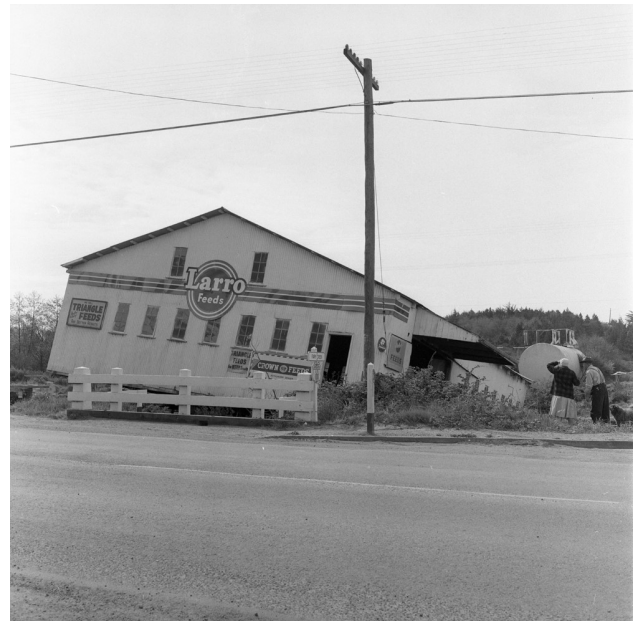
DAIRY COOP, FEED STORE FALLING INTO FAIRY CREEK, 1956

Your membership is very important to Bandon's museum. A membership does not mean you are required to volunteer or take part in the museum, just that you support what we are doing. But if you would like to become a volunteer we would love to have you, and we always need volunteers.