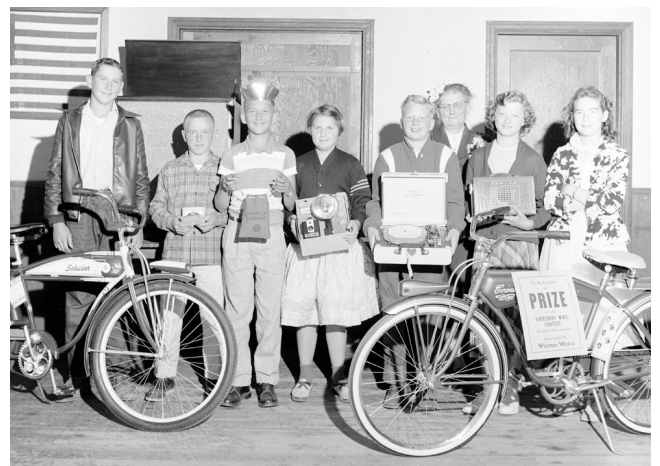
CONTEST WINNERS APRIL 1956, WESTERN WORLD PHOTO