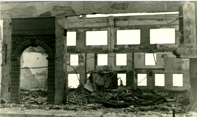
Fire Burned Out Almost Every Business

Bandon would remember the fire of 1914, a restaurant fire that spread and destroyed three city blocks, as “the big one” were it not for the 1936 fire, a forest fire that swept through the area destroying farms, neighborhoods and almost every business.