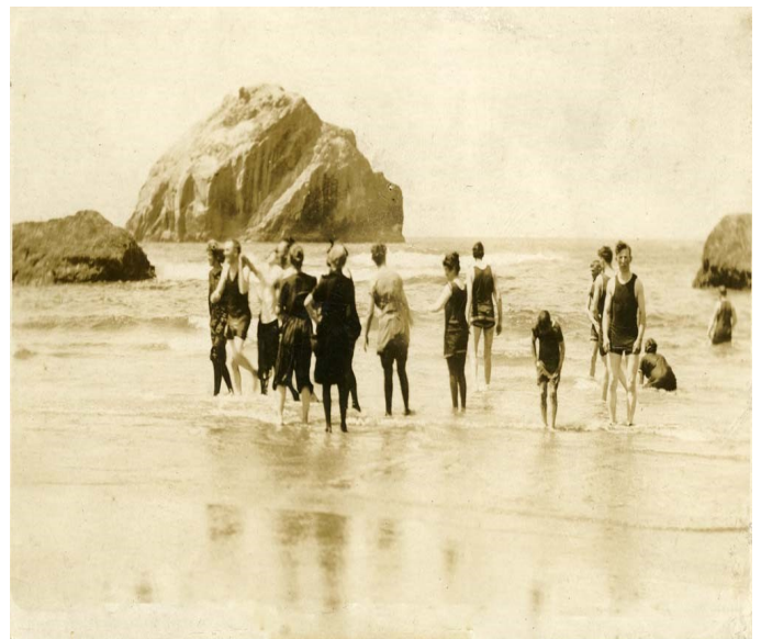
Enjoying The Beach At Face Rock

Over time, the Coos Museum plans to tell the story of every county community, but Bandon will be featured on opening day.