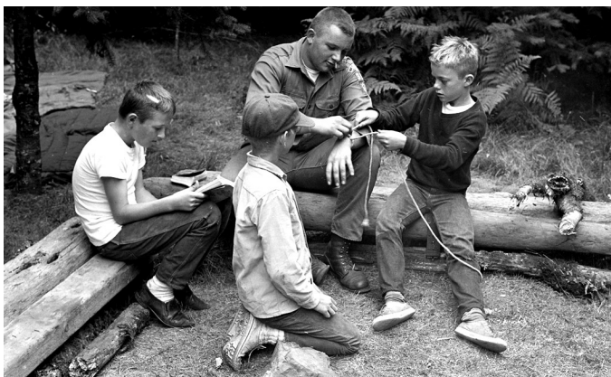
Boy Scouts troop outing August, 1965