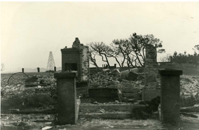
Residential Remains After The Fire

The current shape of the Bandon school system, the configuration of grades and buildings, was set 40 years ago in the aftermath of an arson fire that destroyed Bandon High School.