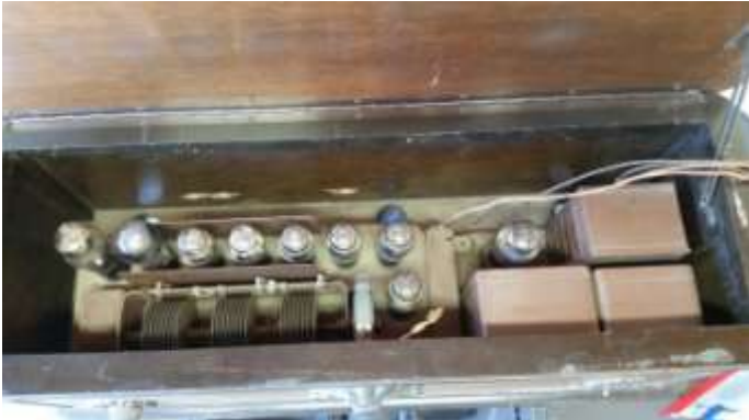
Electronics before restoration

The electronics are contained in two chassis sections, one for the supply of power and the second for the remaining components. They are connected by a terminal strip and wires found under a cover plate.