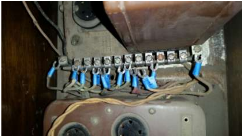
Connecting Terminal Strip