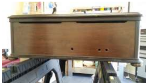
Back of radio