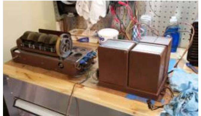
Electronics out of the cabinet