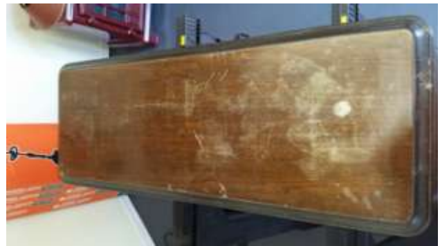
Top of the radio lid