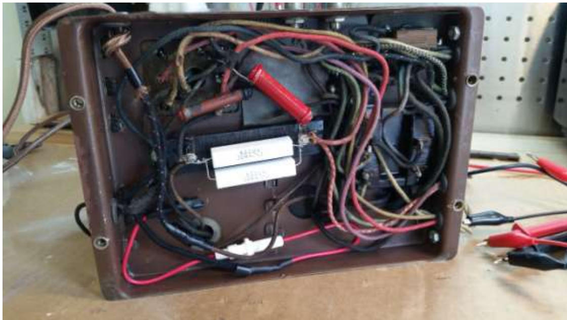
Plate Resistor Repair and Fuse Added

The 2250 ohm wire-wound plate resistor was open and replaced with two parallel 4700 ohm 10 watt wire-wound resistors. The parallel resistors yield a 20 watt 2350 ohm resistor. Close enough in resistance and overkill in wattage. A 1.5 amp fast blow fuse was inserted into the new reproduction cloth covered power cord line for safety. I kept it under the chassis for appearance although this will require the power supply to be pulled from the cabinet for replacement.