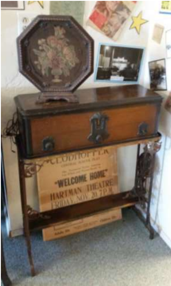
Radiola 60 with 103 Speaker unrestored

The radio's cabinet was in relatively good condition although the lacquer was cracking, there were water and paint stains on the lid, the color on the front was faded and a small piece of veneer was missing on the top. In addition, someone in the past had drilled 3 holes in the back of the cabinet to provide access to the compensation capacitors on the chassis. I elected not to attempt to fill these holes.