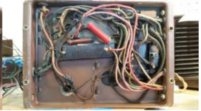
Underside of Electronics and Power Supply

The main restoration of the units was a general cleaning followed by the replacement of the paper capacitors housed in the capacitor can on the power supply. This required dismantling the can, removing the old paper capacitors and replacing them with Solen metalized polypropylene capacitors rated for 630 volts. The wiring diagram is found in the Radiola 60 Service notes on p. 18 (Figure 14).